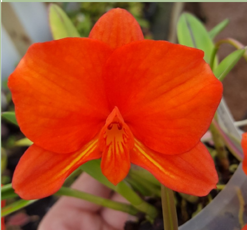
Brassocatanthe Marlene Caldwell