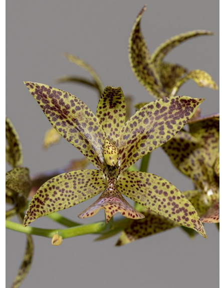
Cycnoches Wild Sunsets