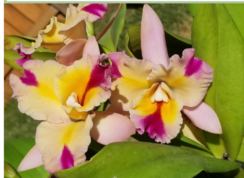
Slc Golden Wax 'Lonestar'