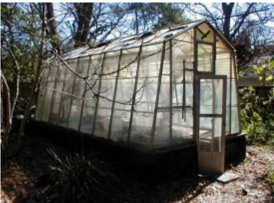
Left: Greenhouse donated to the HOS by the family of Jean-Louis Amand. Auction available to HOS members only. View in color online at the HOS website ( www.houstonorchid.society.org ).

The greenhouse is a 18'x9'x8 ½' (l,w,h) aluminum frame, glass paneled, "Lord and Burnham" structure. (They are a quality firm, and prospective bidders can visit their website to see comparables.) It is in marginal condition with many glass frames broken, but the frame is sound. Two full rows of roof panels on one side are replaced with wood framed plastic panels. A few other glass panels are broken, missing or have been replaced with Plexiglass. The bottom frame is set on an unsalvageable wood foundation. The existing foundation cannot be reused. I estimate that it would take a full day's work, perhaps two, to dismantle and remove the structure. This is a great opportunity for someone who has construction skills.