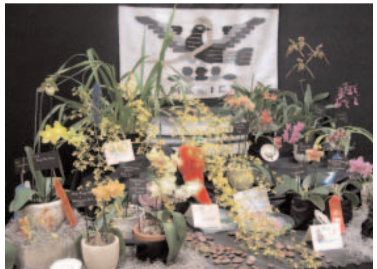
Newcomers exhibit interests spectators with its balance, plant diversity, and focal attraction to it's star, Onc. spachelatum , flowing into center of exhibit.