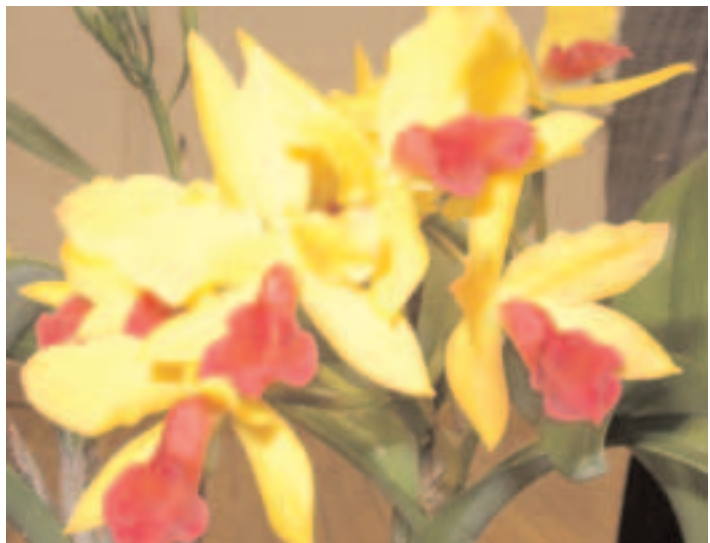
Plant table winners. See article in column to left. Species top.