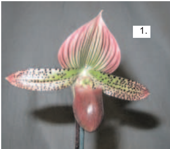
Left and below left: Houston Judging Center's February awards. Details in article on page 2.